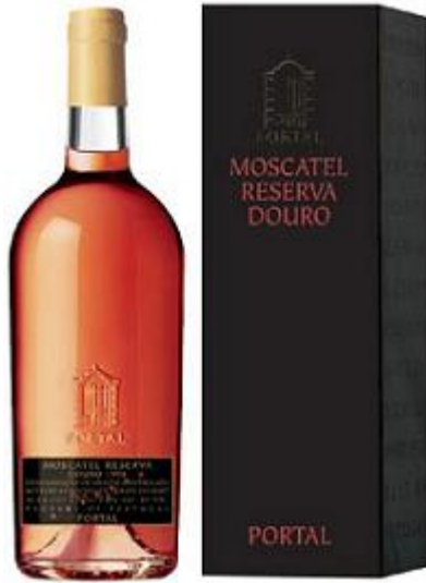
2004 Quinta do Portal Reserva Moscatel (Douro, Portugal) Wine - Dessert $34.99 (750mL)

In the creation of this excellent dessert wine, Portal considered the unique characteristics that barrel aging offers to Douro's fortified wines. The result is this complex and elegant wine with its panoply of characteristic Moscatel aromas, especially honey, nuts, rancho and orange rind. The acidity is subdued, yet still has enough presence to balance everything out. Serve this between 15°-17°C with your favorite sweet desserts.